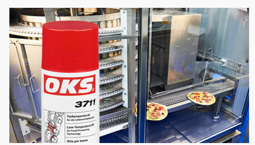
Low-temperature oil for frozen food manufacturers