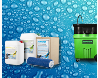
Tips to maintain your Rozo washer